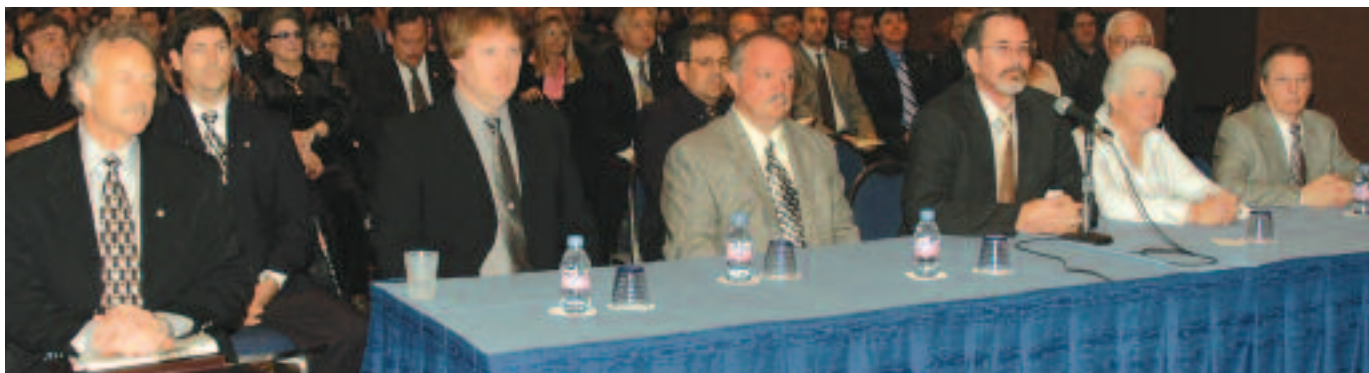
The Host Locals of the Mid-Winter General Executive Board meeting welcomed the Official Family, Local Union Representatives and guests to Orlando.

799, Philadelphia, PA/Camden, NJ; 800, Los Angeles, CA; 822, Toronto, ON; EE/BPBD 829, New York, NY; USA 829, United States; 835, Orlando, FL; 839, Hollywood, CA; 847, Hollywood, CA; 849, Atlantic Canada; 871, Hollywood, CA; 873, Toronto, ON; 883, Cleveland, OH; 891, Vancouver, BC/Yukon Territory; 892, Hollywood, CA; 927, Atlanta, GA; 18032, (ATPAM) New York, NY; and B192, Hollywood, CA.