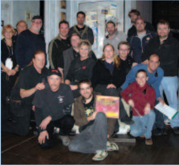
Local No. 6, St. Louis, and the road crew from The Drowsy Chaperone at the Fox Theatre in early November.