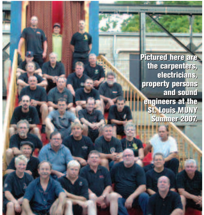
Pictured here are the carpenters, electricians, property persons and sound engineers at the St. Louis MUNY Summer 2007.