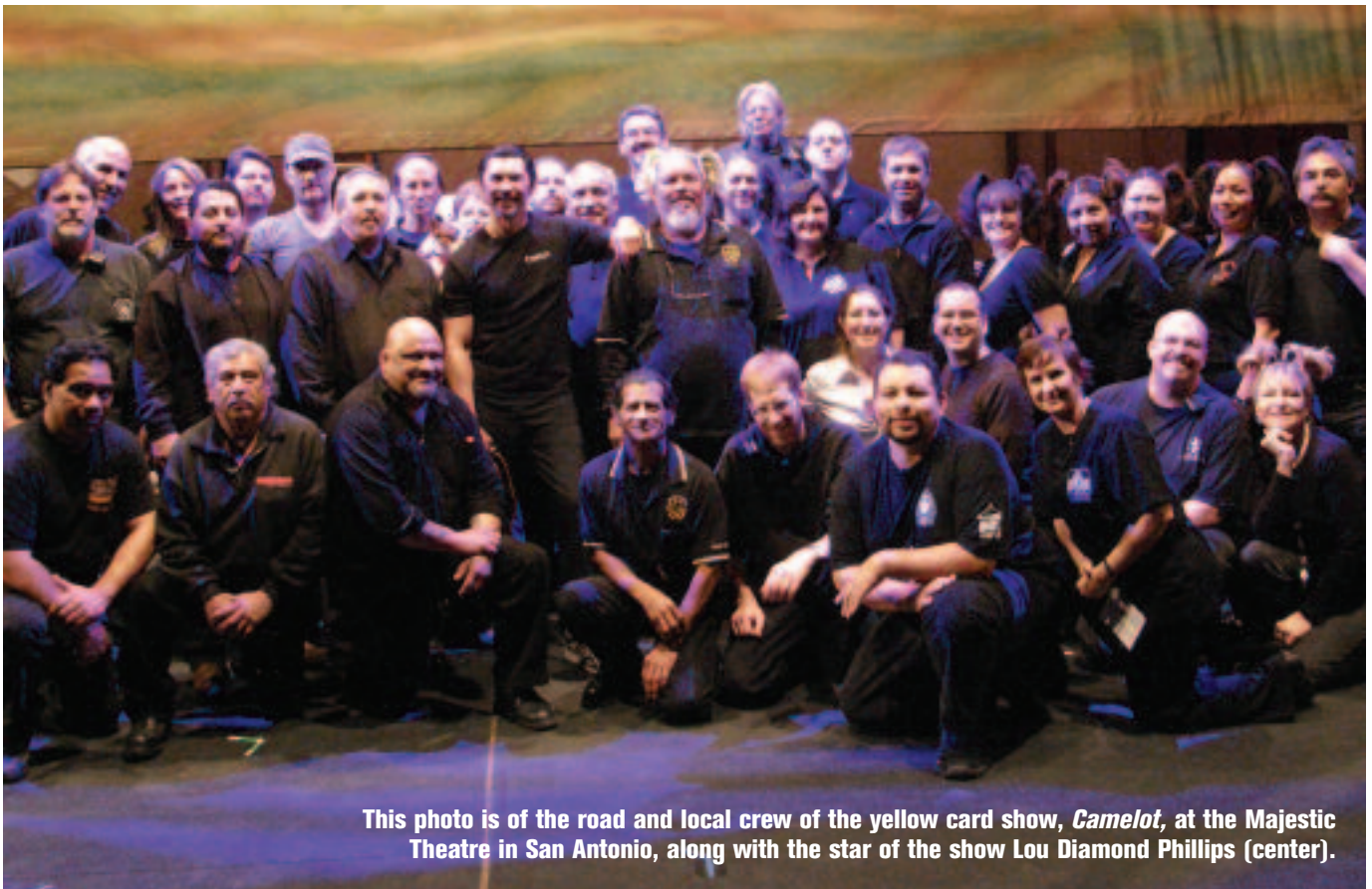
This photo is of the road and local crew of the yellow card show, Camelot , at the Majestic Theatre in San Antonio, along with the star of the show Lou Diamond Phillips (center).