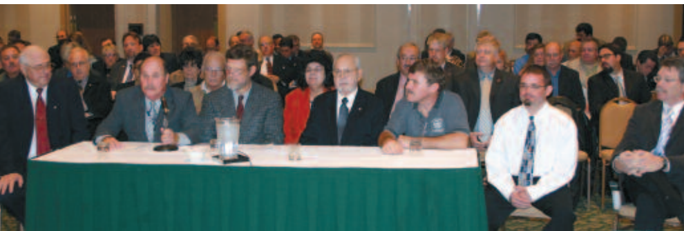
Representatives of the Host Locals welcomed the members of the General Executive Board.