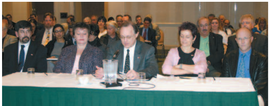
Representatives from United Scenic Artists Local 829 reported on the successful negotiations with the Association of Independent Commercial Producers.