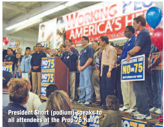
President Short (podium) speaks to all attendees at the Prop 75 Rally.

The outcome of this combined effort was that all of the proposed California Special Election Propositions were defeated. This effort is an excellent example of what can be accomplished when unions representing a diverse group of industries work together.