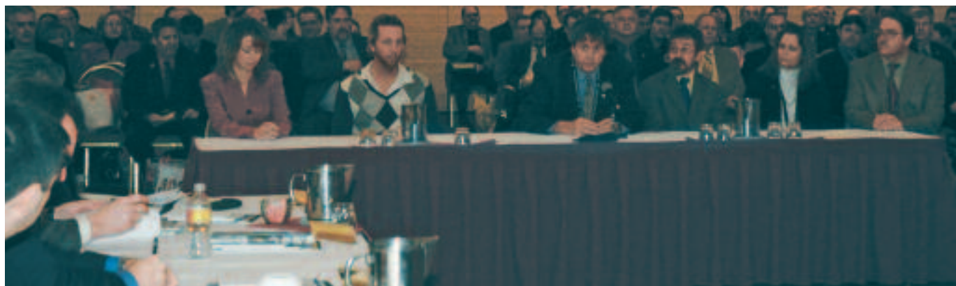
The representatives of the Host Locals greeted the members of the Official Family, to start of the meeting in Albuquerque, New Mexico.

The Fund offers a broad spectrum of programs, including comprehen-