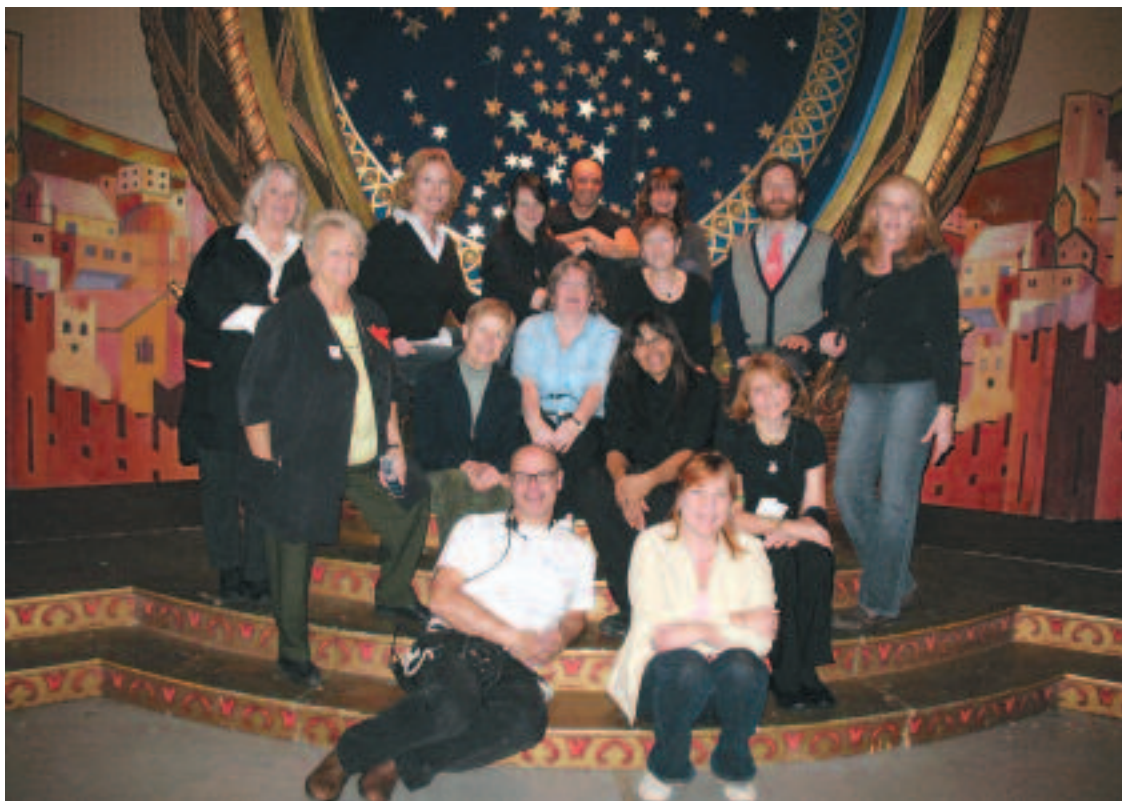
This photo is of the IATSE Local 822 wardrobe, hair and makeup crew of the "Nutcracker" for the National Ballet of Canada this past Christmas season.